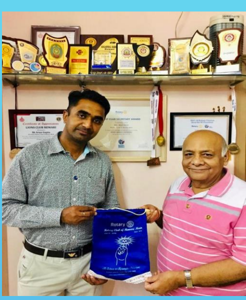
Club Assembly & General Meeting 30/06/19

Time for Family Time for Work Time for Community Rotary Time to make A DIFFERENCE Time for Rotary